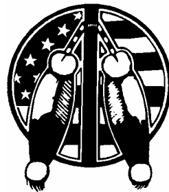
Great Lakes Inter-Tribal Council Inc.

Great Lakes NARCH Native American Research Center for Health